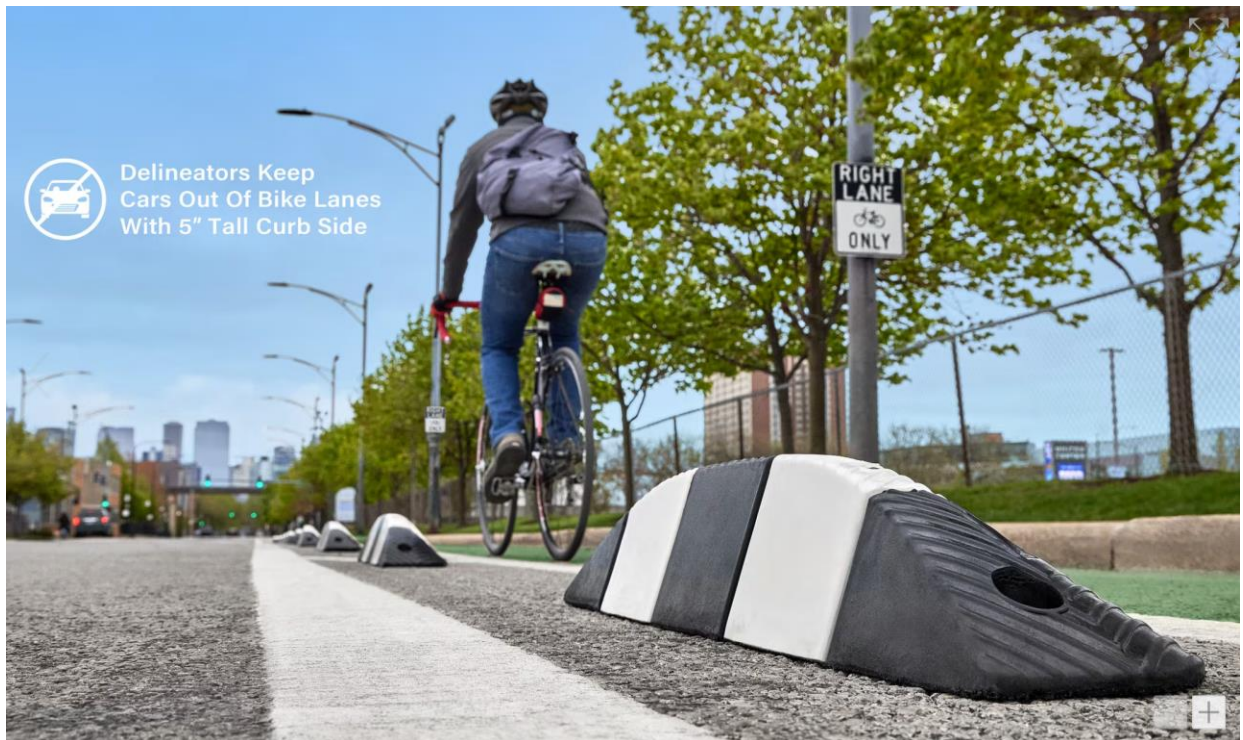
Figure 2 – 5" High Modular Curb

Staff believes this modular curb will be a much better product for visibility, maintenance, and durability.