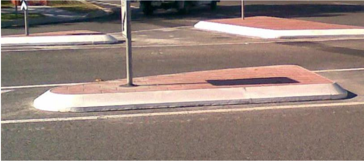
Figure 3 – Parking Island Protection