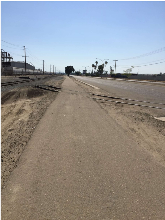
Picture 7 Abandoned rail - user hazard