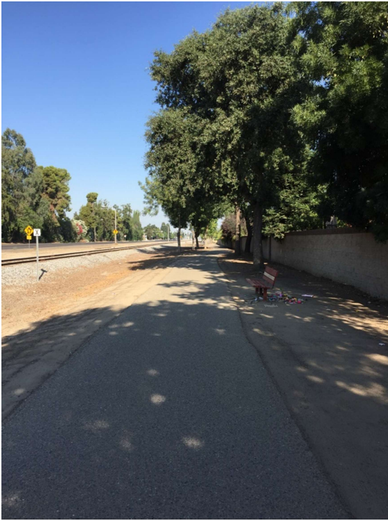
Picture 17 No Trash Receptacles