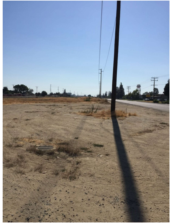
Picture 2 No Infrastructure