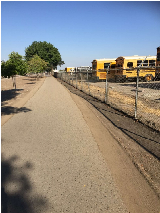
Picture 19 Lack of amenities