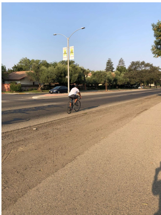
Picture 25 Safety Concern - Cyclists in Roadway