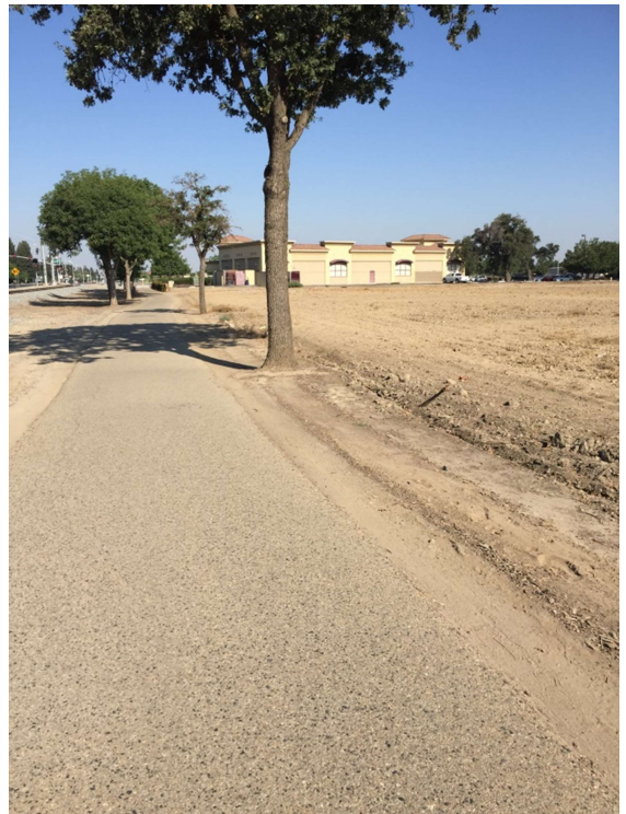
Picture 16 Future Connection