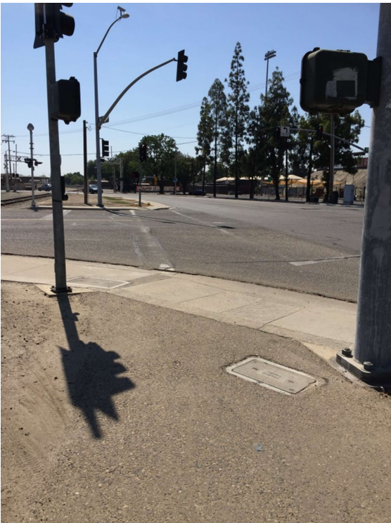
Picture 23 Not ADA Compliant Exposed Crossing