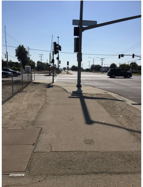
Picture 6 No Existing Ped Crossing