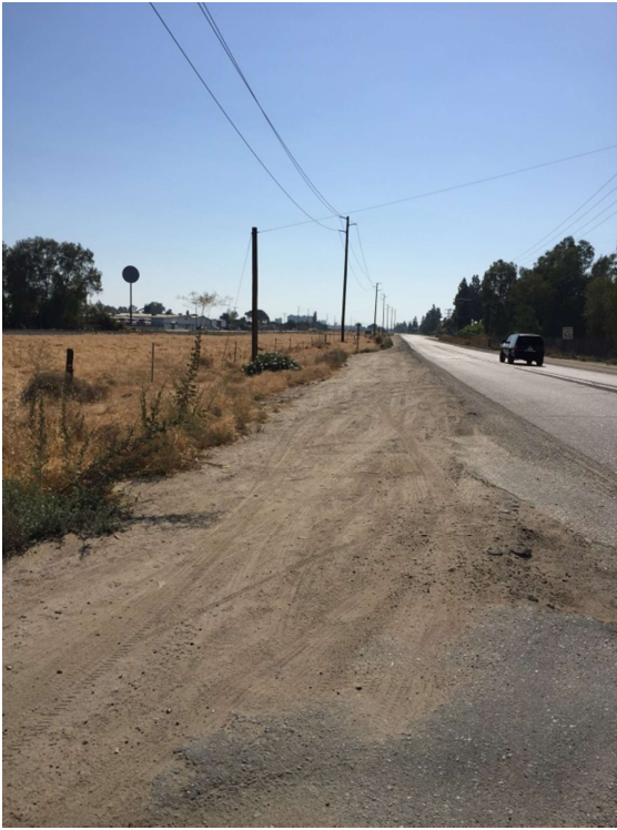
Picture 1 No Infrastructure