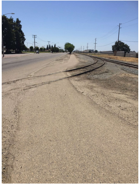
Picture 10 Trail Adjacent to Roadway at Grade