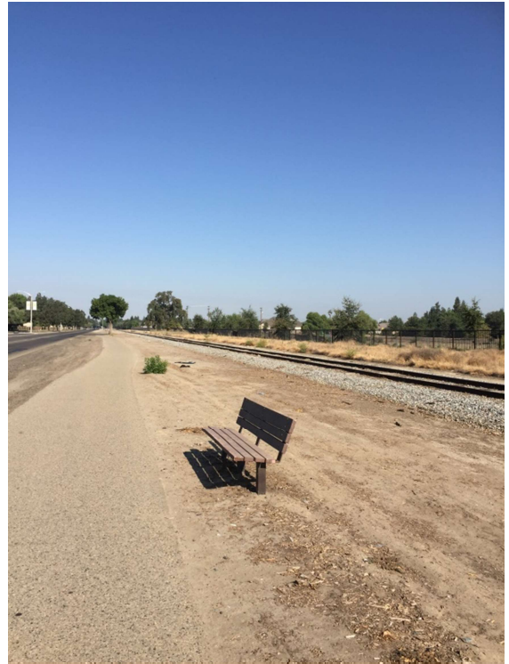
Picture 14 No Shade