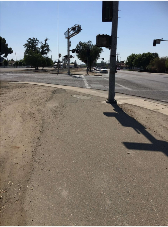
Picture 21 Not ADA compliant Lack of Signage