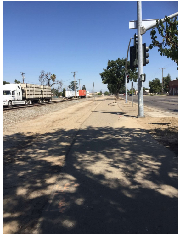
Picture 22 Lack of Separation from Rail