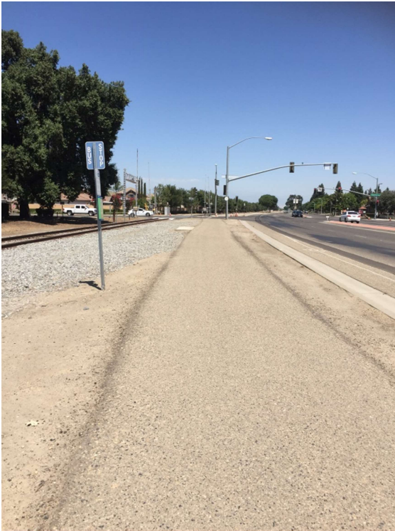
Picture 13 No Shade