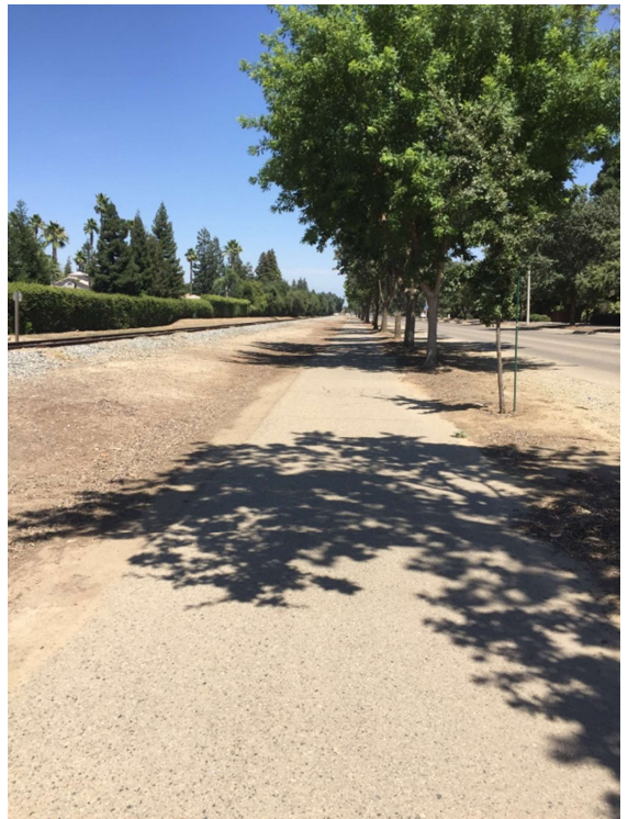
Picture 12 No Lighting Lack of Amenities