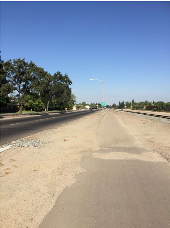
Picture 15 Flood Prone Area, No traffic barrier, No Shade