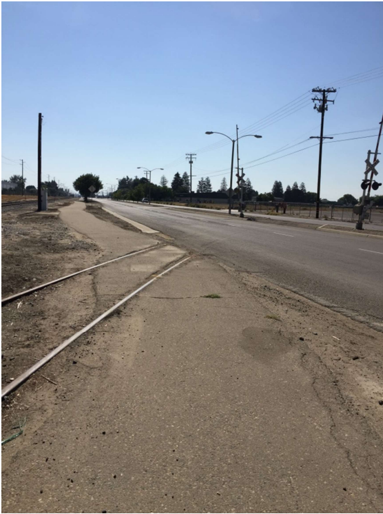
Picture 5 Trail Adjacent to Roadway