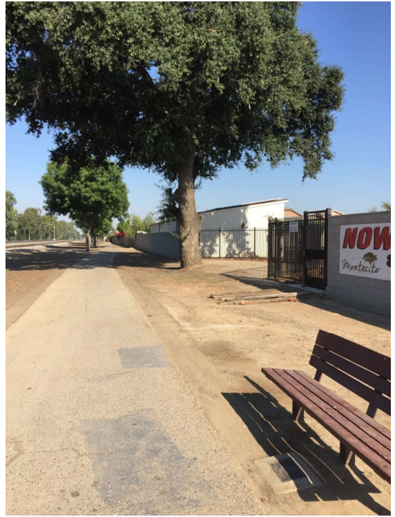
Picture 18 Lack of Access to Adjacent Apartments