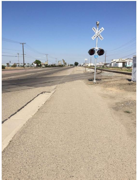
Picture 8 Trail adjacent to Roadway at Grade