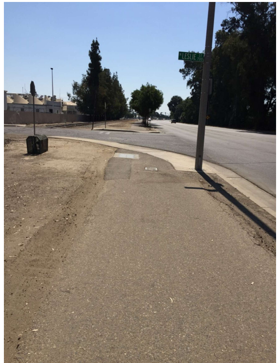
Picture 20 Not ADA compliant, Lack of Safety Signage